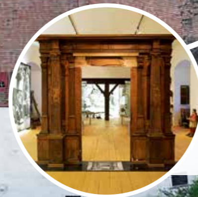
The museumORTH offers interesting information about the history of schlossORTH and life on the river.