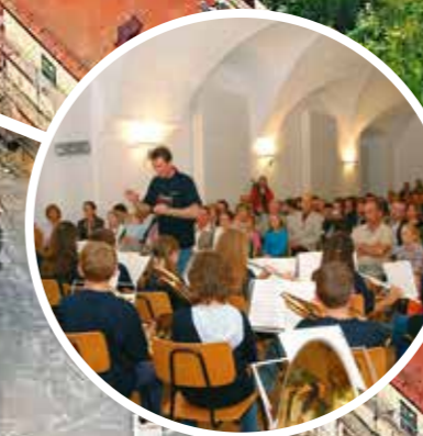
The Event Centre offers ample space for all types of events such as seminars, concerts, parties and even weddings.