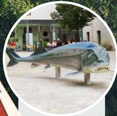
The castle courtyard features a monument in the form of a life-sized sturgeon.