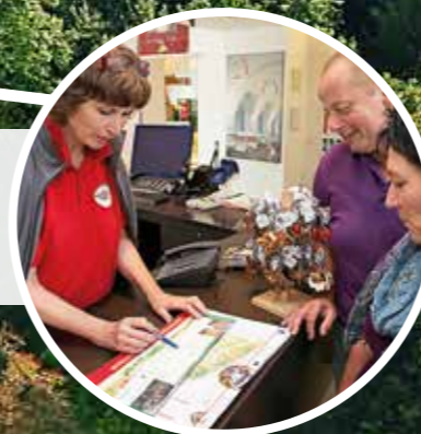
The National Park Centre is the main information and booking point for excursions and tours.