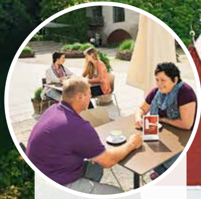
The Schloss Café offers delicious home-made snacks and refreshments.