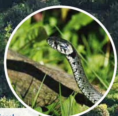
The Schlossinsel showcases the habitats, flora and fauna of the National Park.