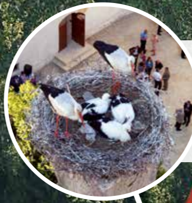
The lookout point on the tower is the ideal place to get to visit the temporary exhibitions and catch a glimpse of storks, jackdaws, kestrels and their nests.