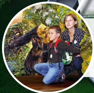
The "DonAURäume" exhibit (note: the exhibit's name is a play on words combining "Danube Spaces" with "Au", the German word for wetlands) will motivate visitors to explore wetlands nature in the National Park.