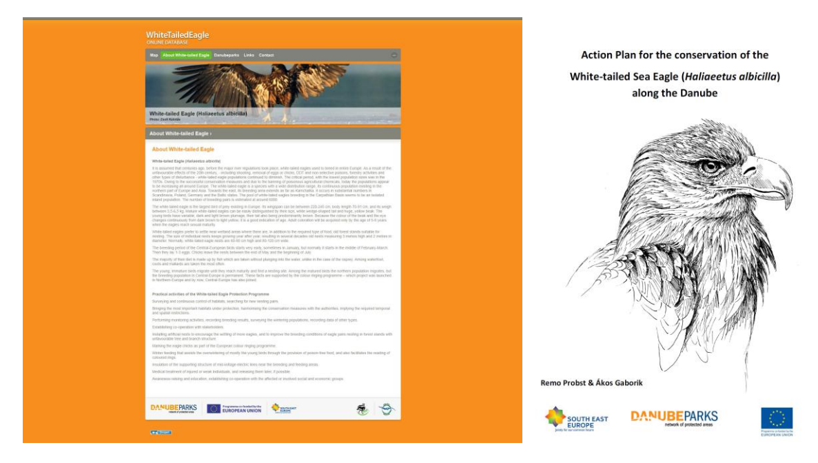
The International Database and the White-tailed Eagle Action Plan – two milestones for the future conservation activities for this species.

The conference in Illmitz 2007 has stressed the need of an International database. In the frame of the DANUBEPARKS network, the Duna-Drava National Park in cooperation with MME /BirdLife Hungary has established this database for South-East and Central Europe. Zsolt Nagy presented this tool and the actual status (e.g. more than 1400 breeding records are included so far). Many thanks to all data providers for their enthusiastic field work and for their cooperation! The speaker highlighted the intended purposes, presented the easy handling and invited all interested people to feed the database with their information. The online database can be found on <a href="http://whitetailedeagle.mme.hu/">http://whitetailedeagle.mme.hu/</a> and will be embedded in the DANUBEPARKS project website <a href="http://www.danubeparks.org">www.danubeparks.org</a> very soon.